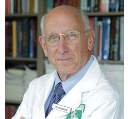
Steven A. Rosenberg, M.D., Ph.D.