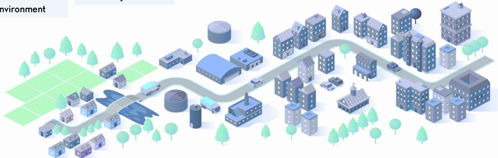
Community-based primary care practices